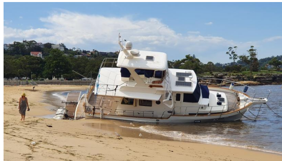
The yacht washed up on Balmoral Beach.

Subscriber only | February 11, 2020 5:58pm