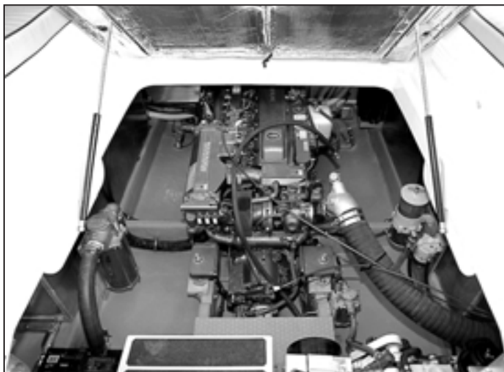
(above) Engine room access