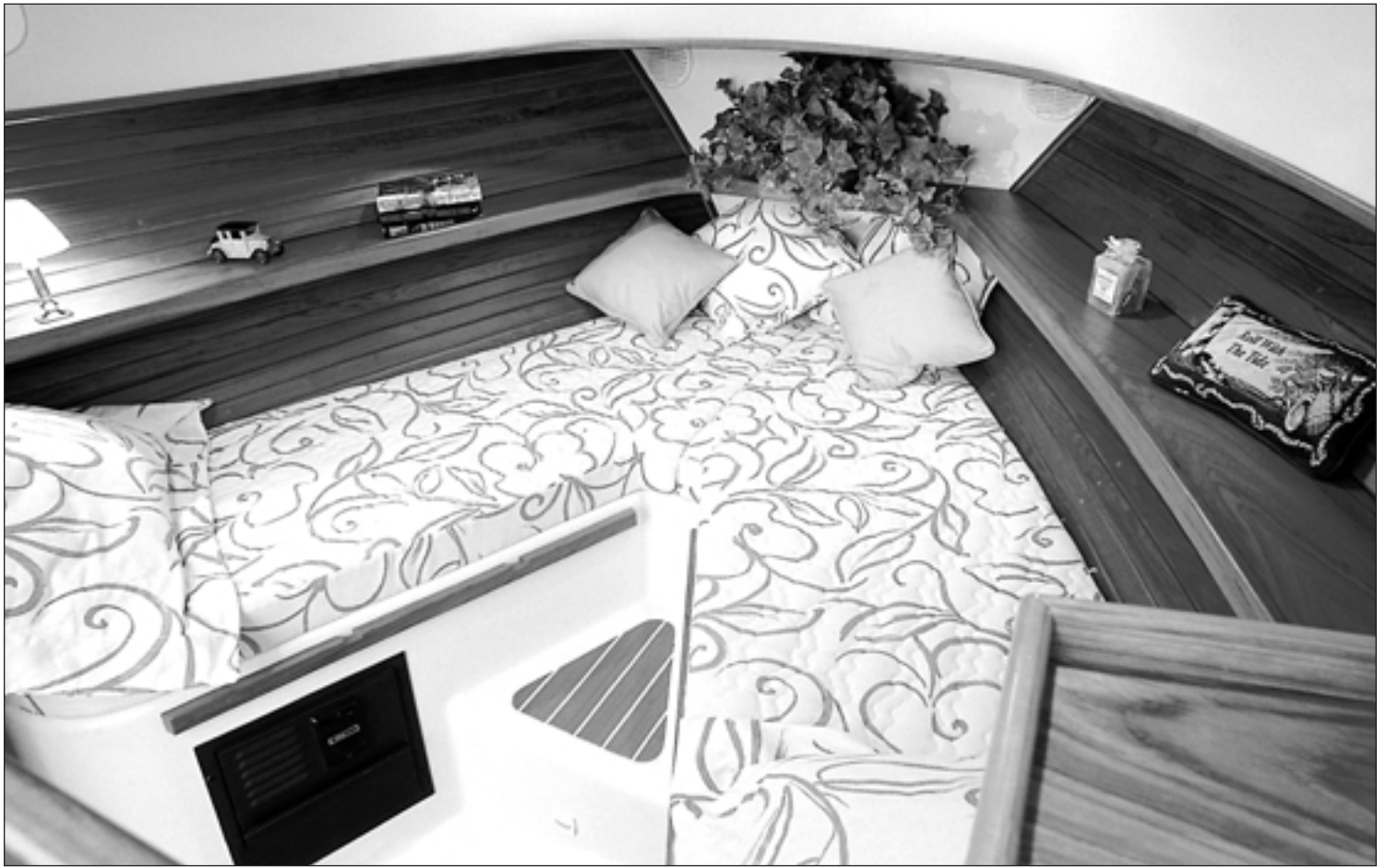
(above) The V-berth becomes a private stateroom by closing louvered doors.

that her sailboat heritage has come to the fore, and it isn't just the teak and holly sole. Use of space is admirable.