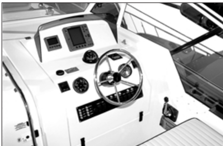
(above) Helm station gives you plenty of room for extra electronics