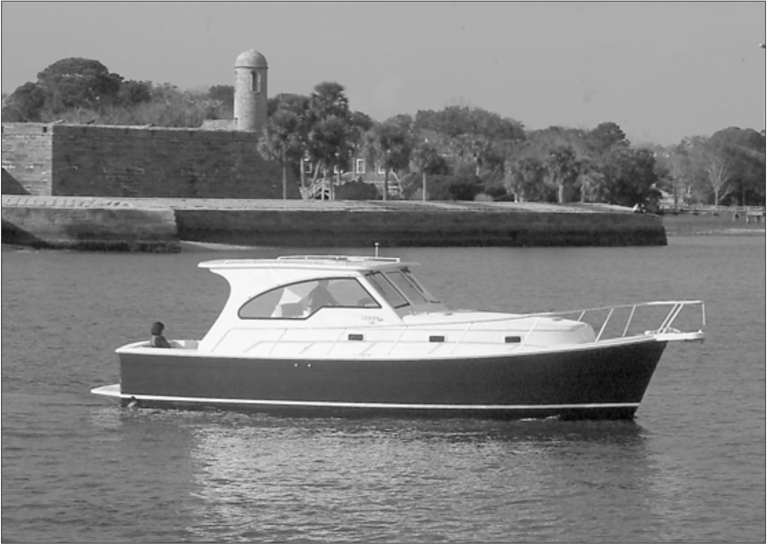
(above) The 34 is also available with this optional hardtop enclosure.

second audio system is available as an option for above-decks, as is a CD changer. The TV is mounted on a swivel platform in the forward cabin, just inside one of the louvered bulkhead openings, so it can be viewed from anywhere below.