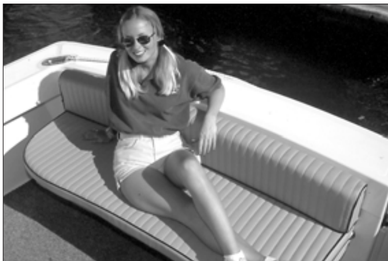
(above) The optional cockpit bench seat makes a great sunpad.