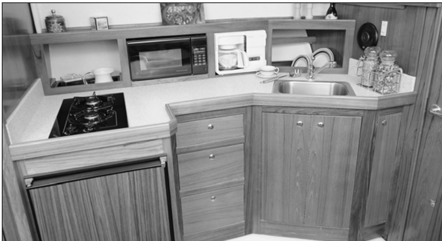
The port-side galley has 6'3" of headroom. Appliances are placed above the counters to provide you with more workspace

As for that forward cabin Mainship's customers were asking for, it really is a cabin, separated from the saloon by a solid bulkhead and louvered door, and wide enough (six feet) so you can comfortably sleep on either leg of the V-berth without adding the filler cushion. A large hatch lets in light and air and the wraparound shelf above the berth is roomy enough to stow all your back issues of PMY and then some. On the other hand, the lockers aren't big enough for much more than foul weather gear and maybe the filler cushion, but again, this is basically a weekender. Deep lockers beneath the berths are adequate for items that aren't often used.