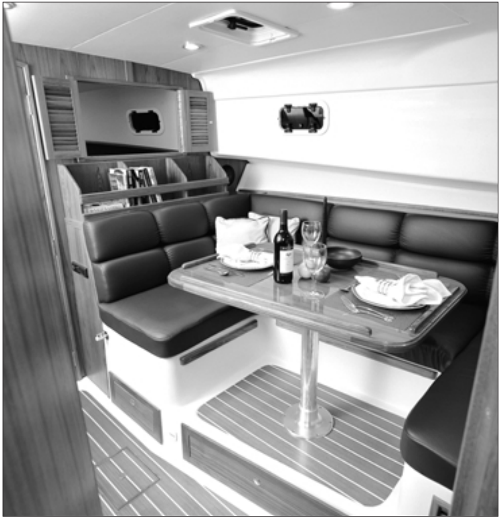
(above) The settee/dinette area seats four comfortably and converts to a double berth.

For entertainment, the boat comes with a 13-inch TV/VCR combo and an AM/FM single-CD player with speaker in the cabin and cockpit. A