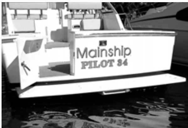
A paragon of New England lobster boat virtue.

RETRO GRADE A. Though classically styled, the Mainship's accommodations